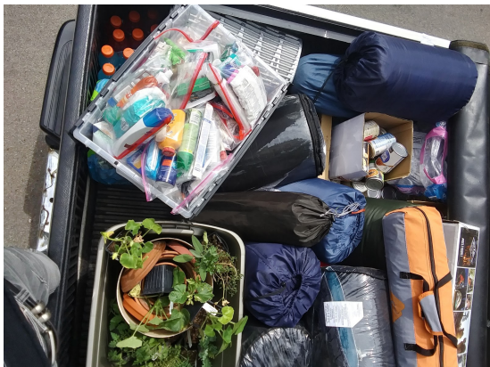
Tents and supplies for street outreach