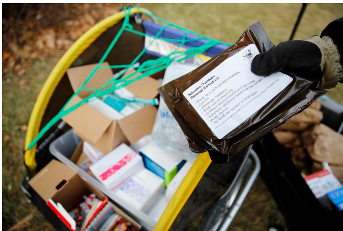
Street outreach via bicycle!