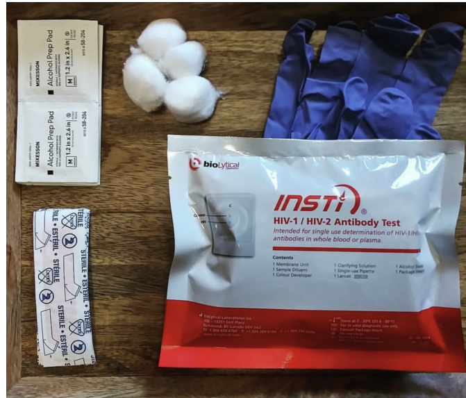
Rapid HIV testing kit and supplies

Southside strengthened our partnerships in 2020 and are able to have health and social services available during outreach and deliveries. This includes a mobile vaccination partnership with Healthcare for the Homeless and the Native American Community Clinic. Starting with Hep A and Flu vaccinations, the program was easily able to switch to COVID vaccinations in 2021.