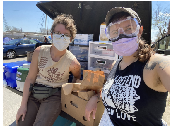
Volunteers at pop-up outreach