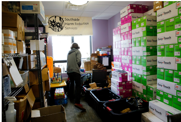
SSHR office and supplies