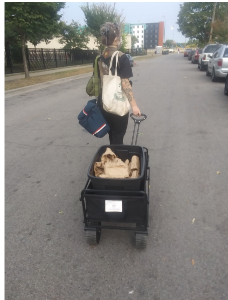
SSHR volunteer on street outreach