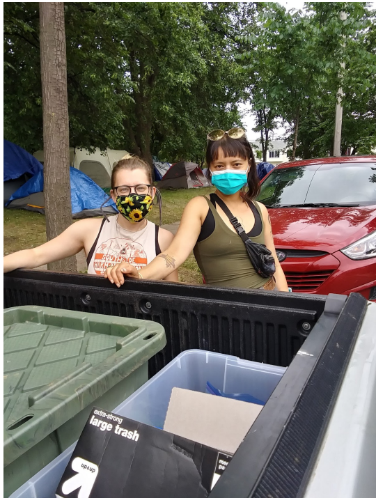
Volunteers of SSHR on outreach

We believe that everyone's voice is important, and recognize that Southside is really created from a whole community of people. To that end, and to emulate the values of Harm Reduction, we are continuing work to cultivate as flat an organization as possible and have as many of our decisions as possible made collectively through the various working groups. While the working groups consist both of folks getting paid and those who are not, everyone has an equal say in decision-making. By having a flat organization we hope to create a space that is open for anyone to make a meaningful and positive impact on the organization and our community.