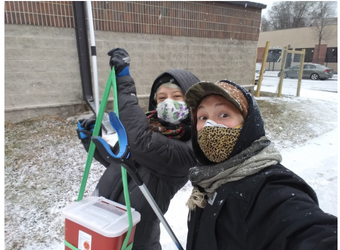
Winter street clean up

We continued to collect syringes in the neighborhood and have been able to connect with housed and unhoused neighbors while doing it. Though most participants, if not all, want to properly dispose of syringes, it is not always possible due to lack of access to disposal resources, and to police targeting of people who use drugs. Picking up syringe litter has been a great way to connect with the participants who help out, as well as with other folks in the neighborhood.