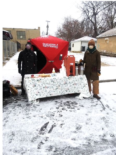
Late December winter outreach